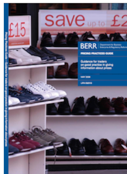
BERR Pricing Practices Guide (pdf, 422kb)

It seems to me that any company advertising their own products on the basis of "Our price £X, RRP £Y" when they themselves have set the RRP is operating in a grey area at best, if they're not actually being downright dishonest. When a supposedly Christian company engages in this sort of practice, it's a double whammy. But what does the Government guidance itself say? Whilst the guidance is not comprehensive, several sections have some bearing on this situation: